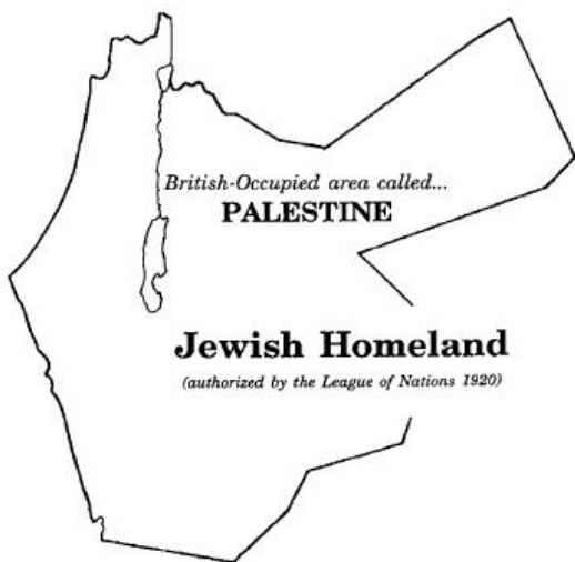
1920: League of Nations

WHY? Repeated 59 times in Ezekiel: THEN YOU WILL KNOW THAT I AM the LORD