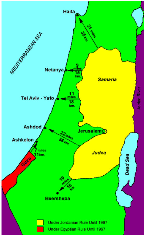
Distances Between Israeli Population Centers and Pre-1967 Armistice Lines