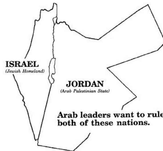
Two Palestinian States